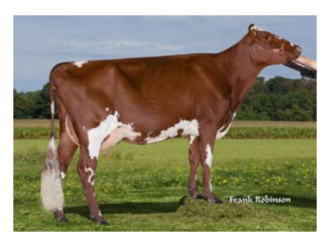
RED with WHITE MARKINGS