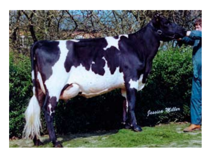
BLACK / BLACK & WHITE