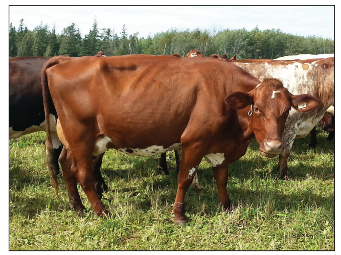
Oceanbrae Logic Feather EX-92

To reserve your share, please contact Ryan. Semen release for Foster is scheduled for later this fall.