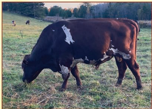
Fieldcrest Ironquest-P EX-90