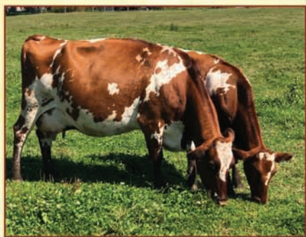
Fieldcrest Picolo Quest 3 EX-90-2E (foreground) 6-1 343d 9272M 4.2%F 3.1%P BCA: 283-300-269