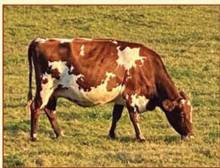
Fieldcrest Quest 16th Full sister to Ironquest, pictured dry