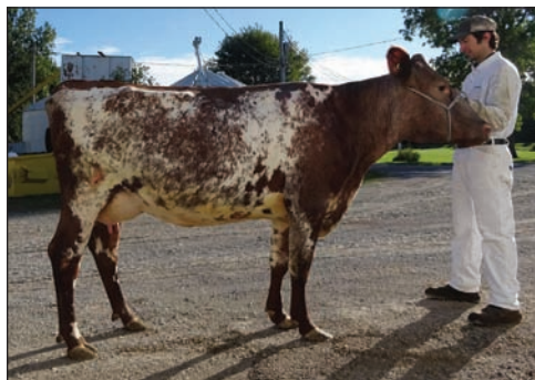
Reserve Grand Champion: Oceanbrae Lass Ballerina