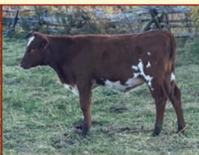
Polled Ironquest progeny: