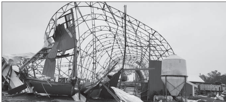
The Oceanbrae free-stall barn the morning after Hurricane Fiona.

All through the morning and afternoon, neighbours and fellow farmers stopped by to see how they could help. We found out that four other dairy barns in our local area had also collapsed in the storm, and there were as many as ten dairy farms across the province similarly affected. Knowing that there were many farms that would need to find alternate arrangements for milking their cows, we started making phone calls to find out who would be able to host some of our herd. In relatively short order, we found one farm about 30 minutes away that would host approximately 30 head, while three other farms hosted 7 to 12 head each. The first load of cows left the farm on Sunday afternoon, with the rest moving over the next few days. We decided that most late-lactation cows would not leave the farm and would be dried off early, so we milked twice a day for another two weeks in order to get these cows dried off. We also had to cull a number of animals, including a few with injuries related to the barn collapse or udder breakdown issues following an irregular milking schedule over the first two days post-storm.