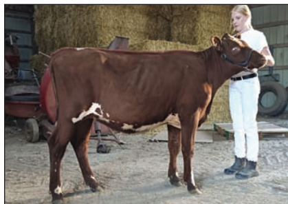
Junior Champion: Koopycrest Astroid Ali Astrid

HM Junior Champion: Oceanbrae Foster Posey - Oceanbrae Farms