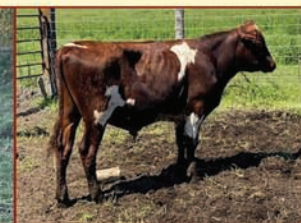
Ironquest x Pingerly bull, 10 mos

Ironquest's MGD: Fieldcrest Quest 2 VG-86 2yr BCA: 239-231-251