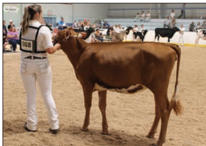
Reserve Junior Champion: Oceanbrae Foster Chickpea