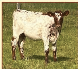
Ironquest x St Clare, 7 mos