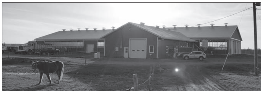
The newly rebuilt Oceanbrae barn in May 2023.