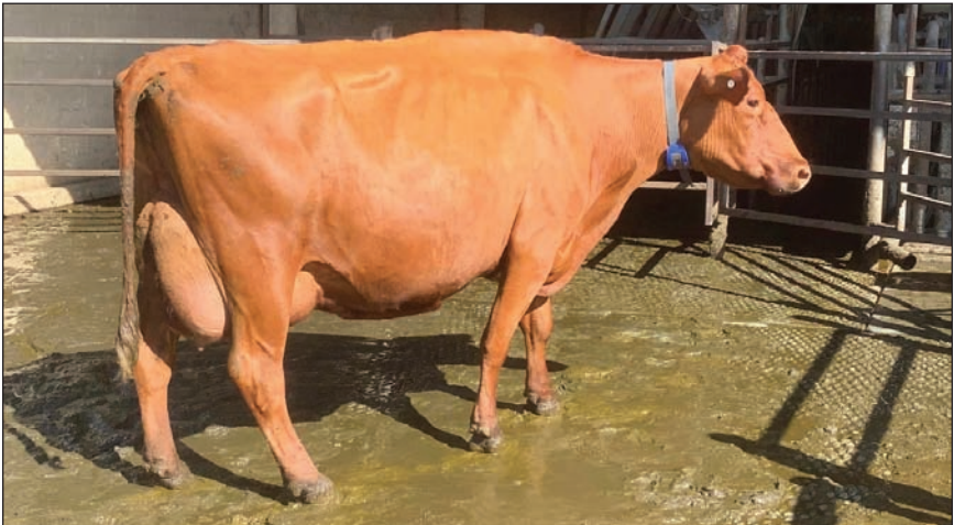
Kangawarra Hope EX-91-2E in her working clothes. Dam of new sire Kangawarra Hazza.

Riversleigh Jiath is another new bull, now available from Semex Australia. This bull represents an outcross pedigree and is backed by an EX92 3E dam with over 80,000 L lifetime production and still going strong. The dam’s rump score of 94 was also an attraction with this selection.