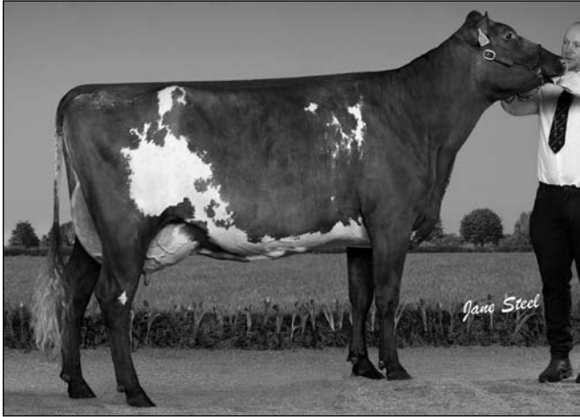
Oxton Ric Wildeyes 970 Grand Champion, UK National Show 2024