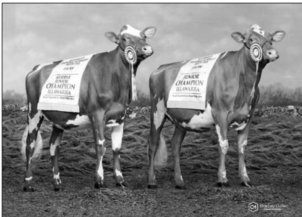
Ferrum Stormyjon Rose and Ferrum Stormyjon Rosie Full sisters that were Junior Champions at 2025 International Dairy Week

Genomic Analysis as part of the registration process is now also available for all bulls which will continue to build the data set.