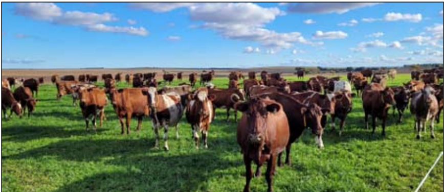
Springvale Herd on irrigated pasture near Murray Bridge, SA.