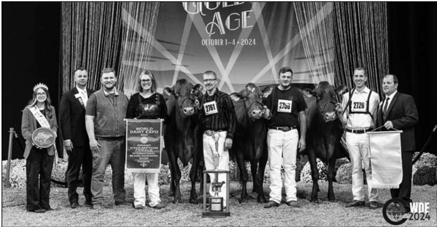
Grand Champions, World Dairy Expo 2024