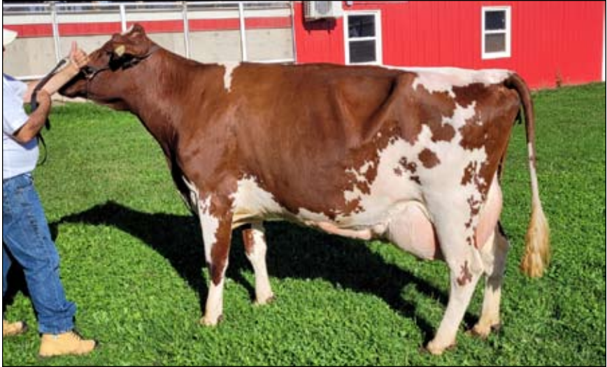
Above: Grand Champion