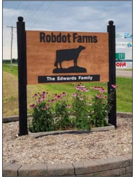
Robdot Farms, home of the Kolson Milking Shorthorn herd.