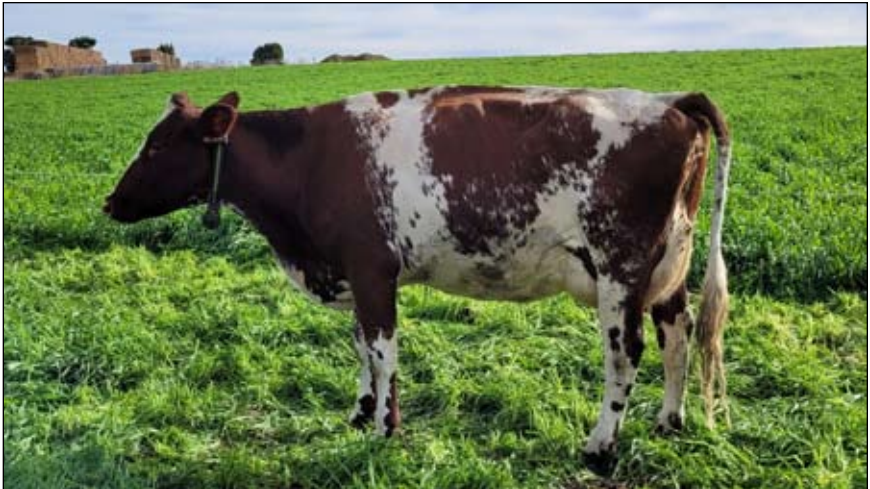
Glenbrook Beauty Queen, daughter of Blackwood Park Liberton and dam of Glenbrook Ghost.

In just two days, I was able to see as many Shorthorn-type cows across four herds as there are milking in all of Canada. All four herds milk between 250 and 500 cows, largely on pasture with limited stored feed. Overhead costs are much lower than here in Canada, and Illawarra cows can compete with other breeds in terms of productivity per acre. All four herds have differences in breeding philosophies but all have had success in the showing as well as in milk production champions. The majority of cows were between 50 and 60% purity. While there was some interest in exploring higher-purity genetics, all herds indicated that this would not be done at the expense of productivity. There are definitely some highly productive, excellent type genetics available in Australia for us to consider in Canada, as long as breeders are willing to use lower purity sires than are common here. Thank you to all of the South Australian Illawarra breeders for showing me tremendous hospitality during my brief time there!