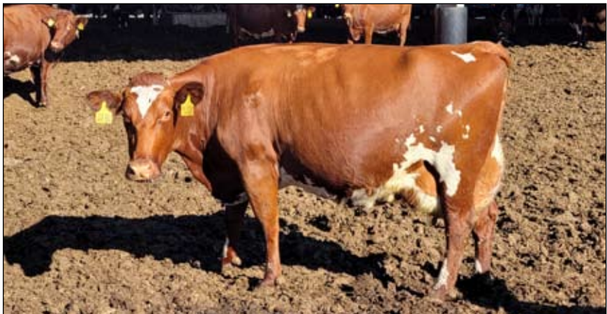
Daughter of Oceanbrae Foster at Treeton Illawarras, Meningie, SA.